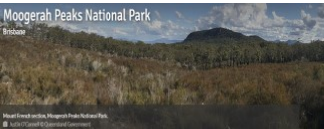
Moogerah Peaks National Park Brisbane