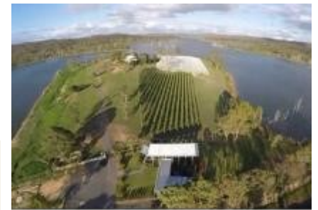
Wineries The Overflow Estate 1895 Boutique vineyard and cellar door located on a magnificent island in the glorious Lake Weyaralong...