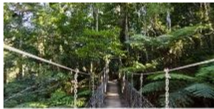
O'Reilly's Tree Top Walk Lamington National Park, Green Mountains Section, Canungra, Scenic Rim Area Queensland 4275