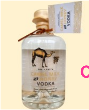
SCENIC RIM DISTILLERS